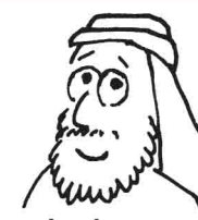
Judas (son of James)