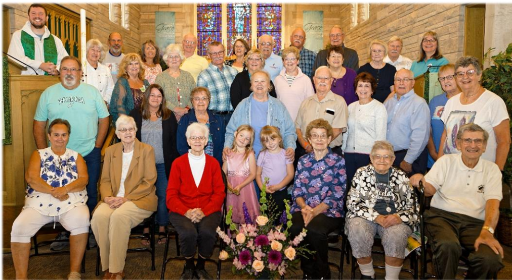
Congregational Photo taken 9/8 by Patrick McGrath on our Kick-Off Sunday!

Monthly News from Port Edwards United Methodist Church